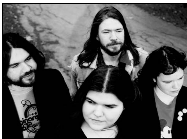
BEST OF 2005: The Magic Numbers