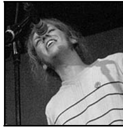
BEST BAND: No Atlas

The DJ contest proved equally tight but eventual winners umopap!sdn & drut were a popular choice