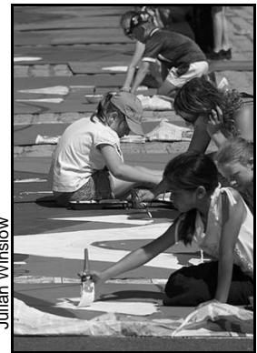
BEST ART: Quay project

Recent weeks and months have seen Britain going Bestival-berserk, with sporadic outbreaks of Bestivity reported in many areas.