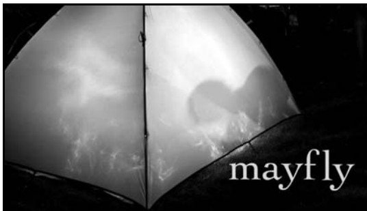
BEST AFTER DARK: mayfly art in the campsite

Tomorrow's edition of The Bestival Bugle will be available from 12 midday. Get 'em while they're hot!