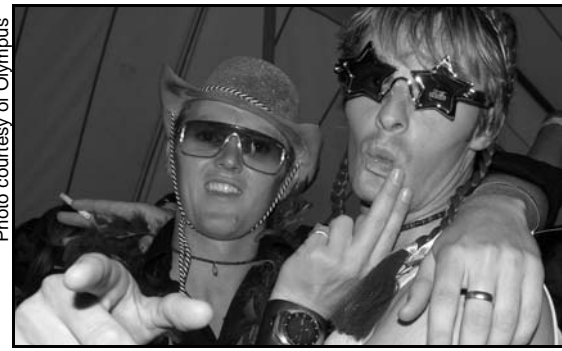
BEST DRESSED: You, tomorrow

Full details of where and when the fun will begin can be found in tomorrow's Bugle, but it's all happening from around 6pm so make sure you allow enough time to get ready!