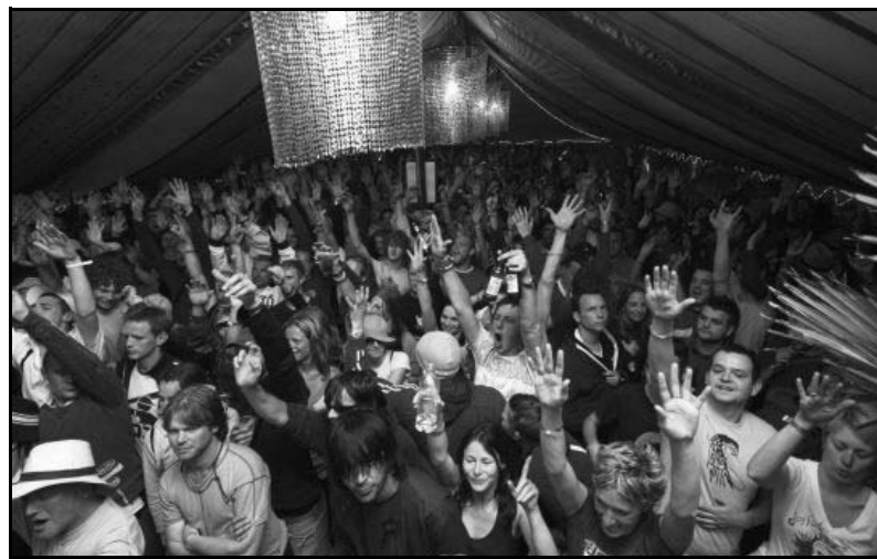
BEST AT THE FESTY: Bollywood Tent