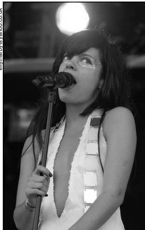
BARBARELLUVA SHOW: Lily Allen