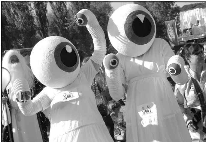
THE EYES HAVE IT: Fancy Dress Parade